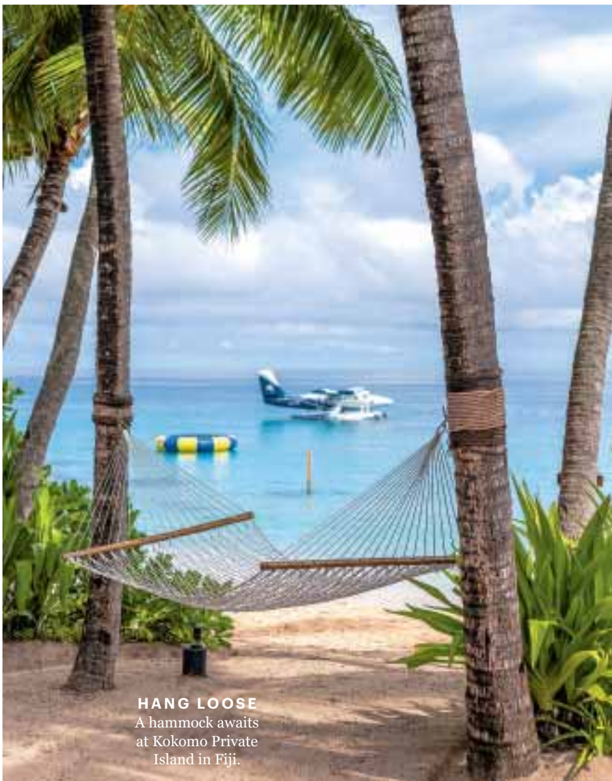
HANG LOOSE A hammock awaits at Kokomo Private Island in Fiji.

email: travellandluxury. magazine@news.com.au