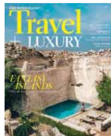
COVER ITALY'S EGADI ISLANDS